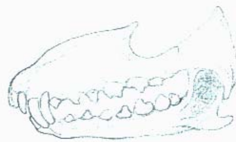
OVERSHOT (Disqualification exceeding 1/8 inch)